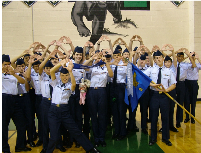
Delta Flight wins Commander's Call.

World wide experiences brought to the classroom.