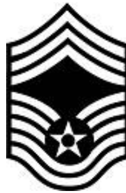
Fig. 4-Active Duty Enlisted Ranks